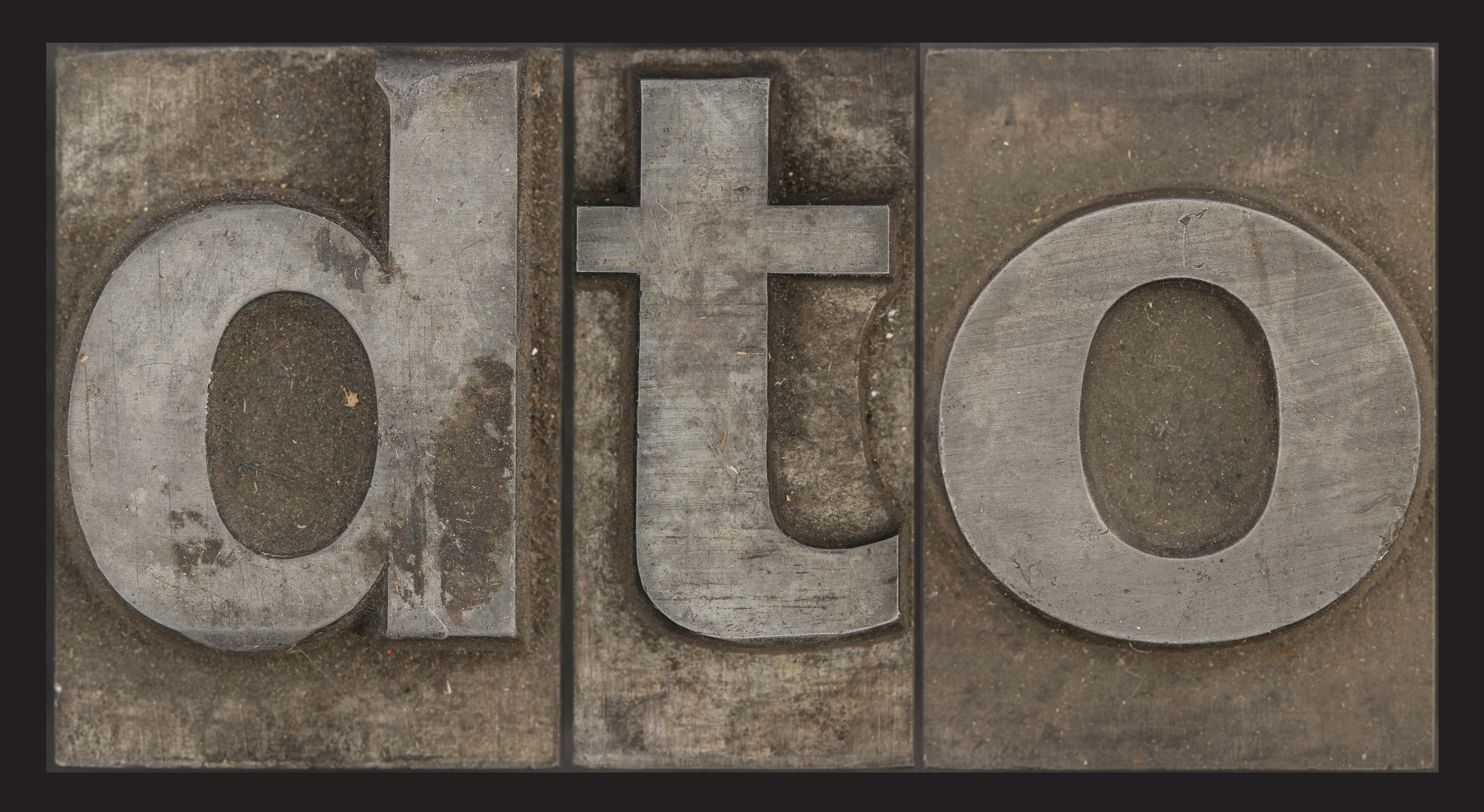
Caslon Doric, Lead type