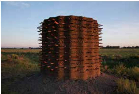
Image Top to Bottom:

DOSU Architecture Studio, Bloom , 2011. Installation view of an architectural application of thermal bimetal, a sheet metal that curls when heated. Image courtesy of artist/Materials & Applications.