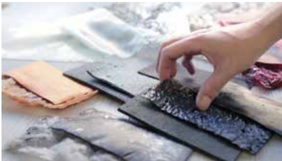
Image Top to Bottom: